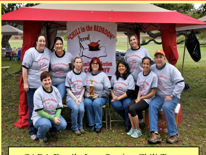
SABA Family Law Section Chili Team