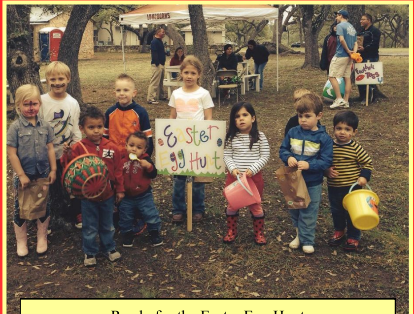
Ready for the Easter Egg Hunt