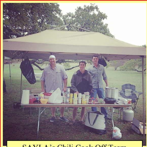
SAYLA's Chili Cook Off Team